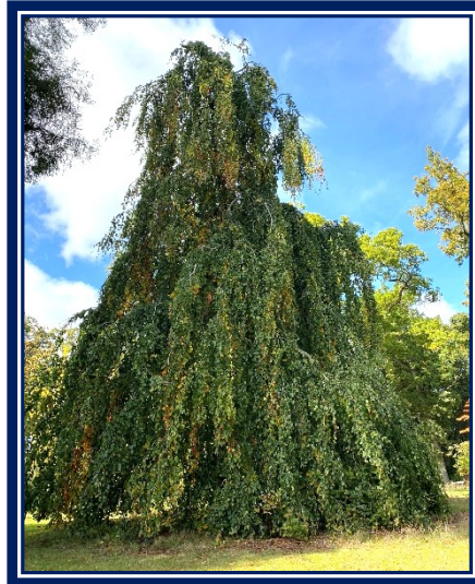
A weeping beech tree. Is there anything underneath?