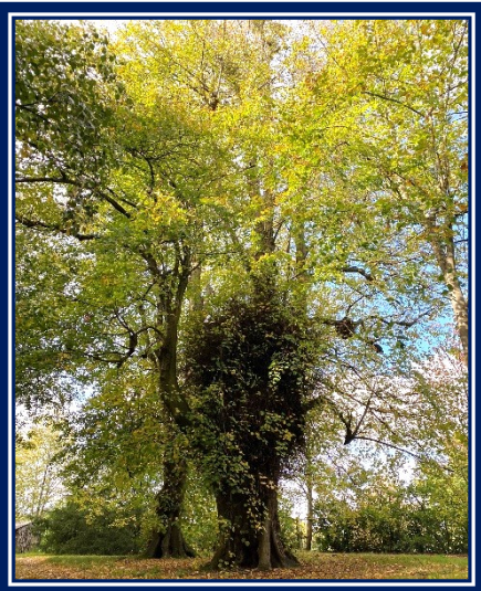
A lime tree. Lime wood is used for carving and making musical instruments.