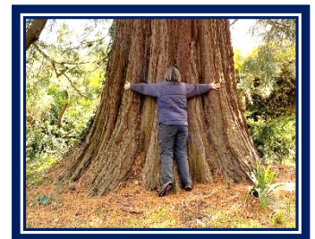
A giant sequoia. The oldest known example of this species was at least 3,200 years old. Ours is just a baby in comparison but it's still a big tree!