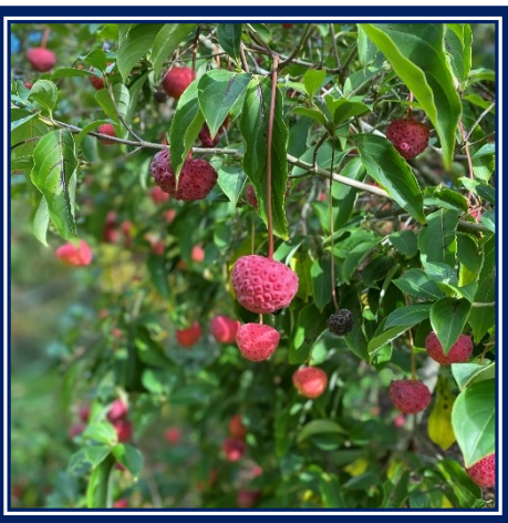
The flowering dogwood, Cornus 'Norman Haddon'. Its fruit look a bit like strawberries but don't eat them!