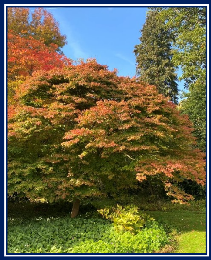
Japanese maples (acers) with their red autumn leaves.

The gardens are home to hundreds of beautiful plants. Here are a few things to find as you explore.